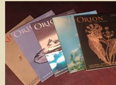
GIVE ORION AS A GIFT