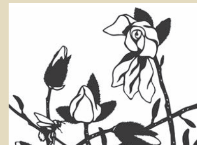
THE ART OF NIKKI McCLURE