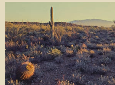
ORION IN THE WILDERNESS