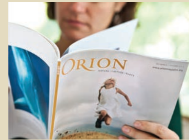
THE VALUE OF ORION

Keep up with Orion between issues via our email updates. We'll alert you to new content on our website: short essays, author interviews, photos, video stories, and special opportunities. Don't miss out! Send your best email address (along with first and last name) to subscriptions@orionmagazine.org .